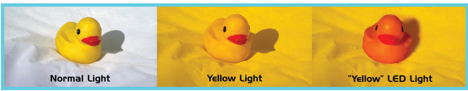
In a yellow LED light, the ducky turns from yellow to red. Thus, "The Evil Duck"

In some cases a loss of only 10% of light may be unacceptable, in others you could stand to lose half of your output and still find the light useful. This is a decision you need to make but it is obviously going to be capitalized on by some marketing. After all, the lights I saw on display were technically still lit, they just didn't have a useful output. I will call an LED a long life lamp but not "lifetime".