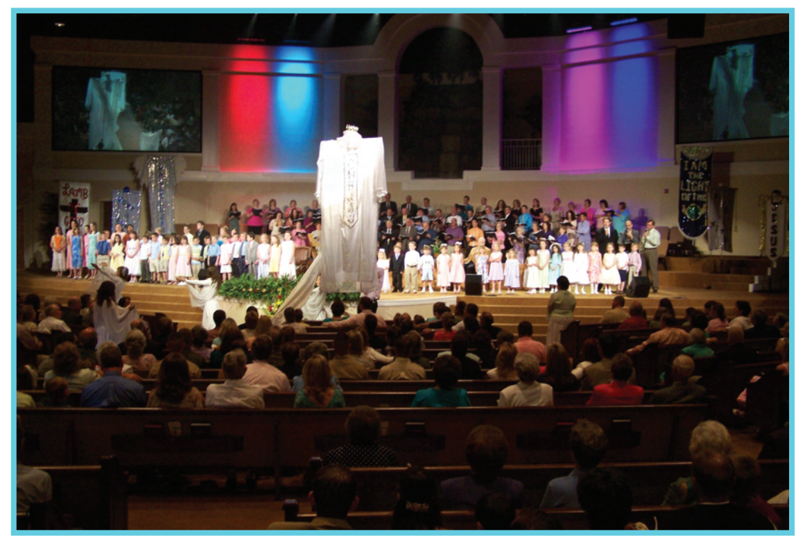
LED's in use as a dramatic color highlight

Okay, so with all of the myths aside, what can we actually use LED for? They are great for water rides. There are many low voltage versions available and with low maintenance they are perfect around pools. Not too many Houses of Worship have waterslides yet though. However there are a lot of pretty hard to reach places where LED lights would be great in churches. I will use LED fixtures in places that I don't want the customer to have to get a lift or scaffold to access every few months. I can put