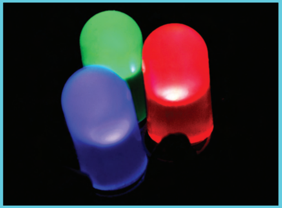
Close-up of 3 primary color LED's

On a neutral surface such as a white screen, I can get most colors because there is no additional filter-